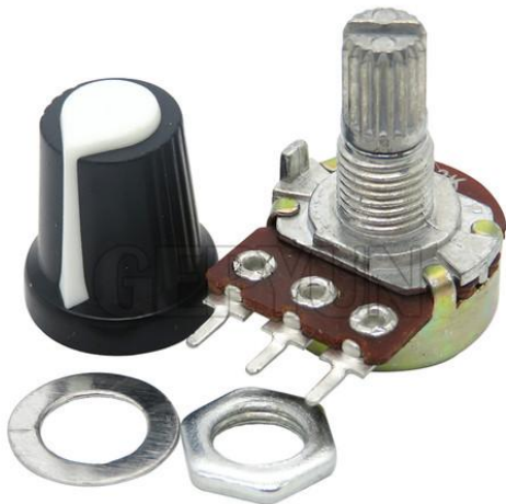
Fig 4 5V, 10kilohm rotary potentiometer

Components-3 pins (it consists of 2 pins and a center pin (wiper) that rotates clockwise and anti-clockwise for varying resistance).