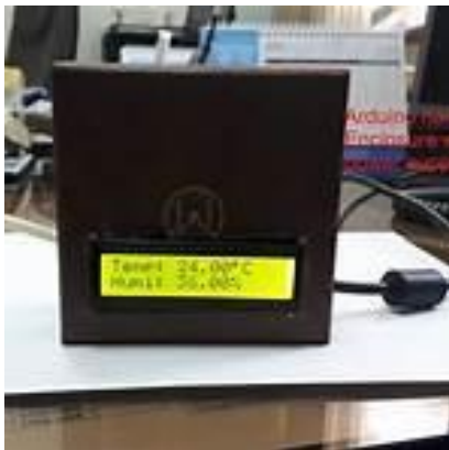
Fig 9 Pictorial view of the developed data acquisition device

The pictorial view of the temperature and humidity data logging device is shown below .It presents the general and final enclosure of the hardware electronic components (active and passive components) devised in the design process and implemented of the data logging system.