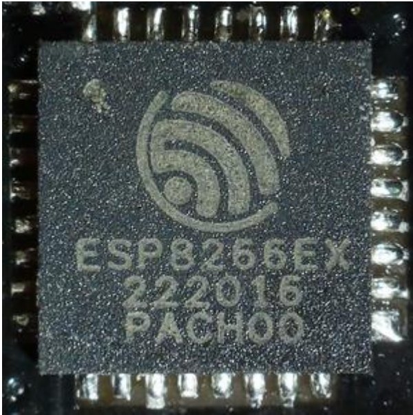
Fig 2.The ESP8266 Wi-Fi module (node MCU Version)