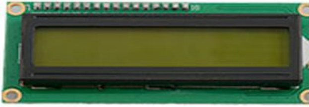
Fig 3 16*2 LCD display Module with interface pins (16 pin interface)