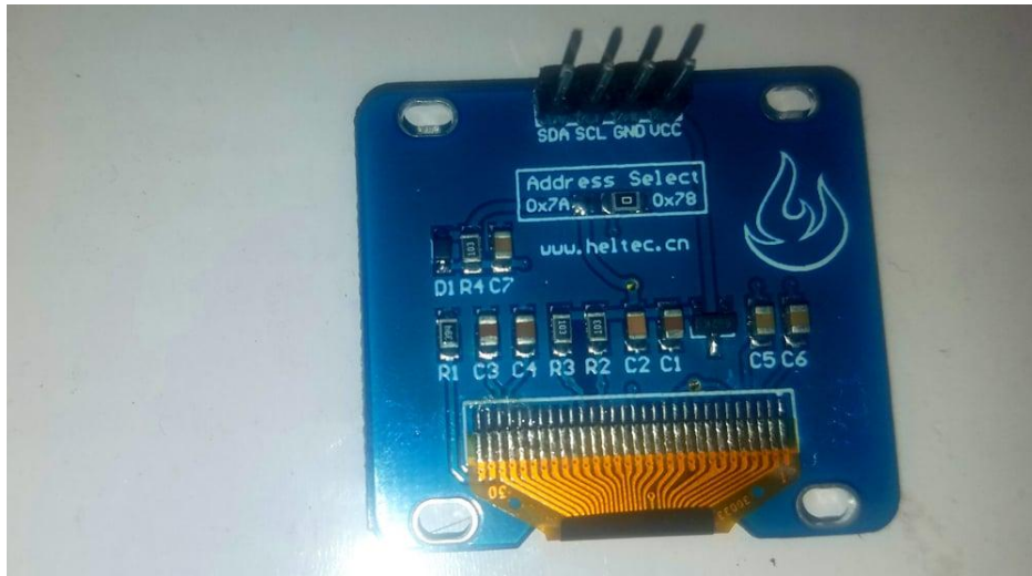
Fig 7 An OLED Display Module with Pin configuration and interface

The above diagram shows the pin mapping of the OLRD Display module .The detailed pin